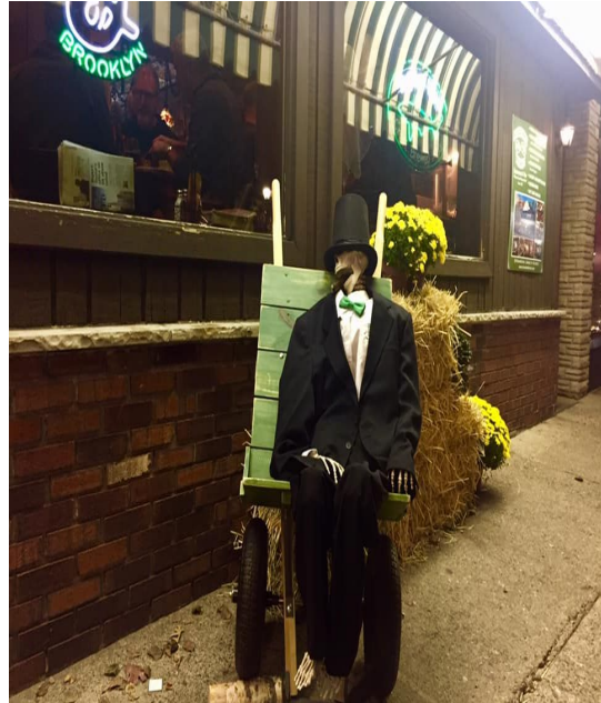
The Famous 1940 Presidential Election Bet Wheelbarrow Story: Great History from the Cloverleaf Tavern and Caldwell, N.J.