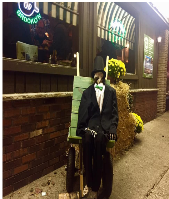
The Famous 1940 Presidential Election Bet Wheelbarrow Story: Great History from the Cloverleaf Tavern and Caldwell, N.J.