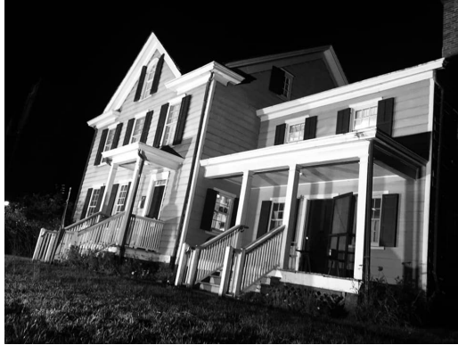
A “Spooky” Birthplace.... must be time for a tour!